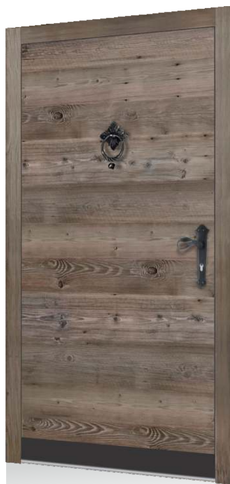
HTF 100 Q