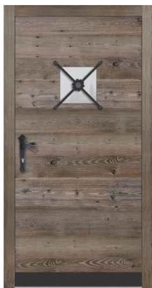
HTF 103 Q