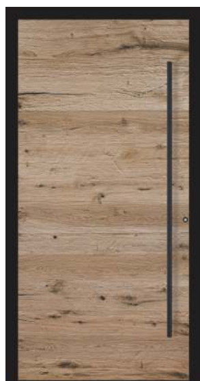
AT 100, New Forest TRAUNSEE