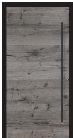
AT 100, New Forest MONDSEE