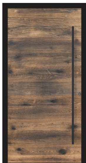
AT 100, New Forest ALTAUSSEE