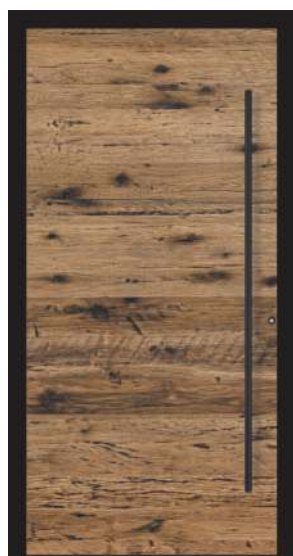
AT 100, New Forest WOLFGANGSEE