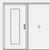
Entrance door with side light (HTA-08 HA80-V)